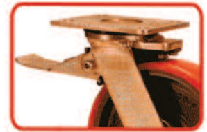
Total Lock (TL)