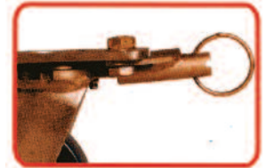
Directional Lock (DL)